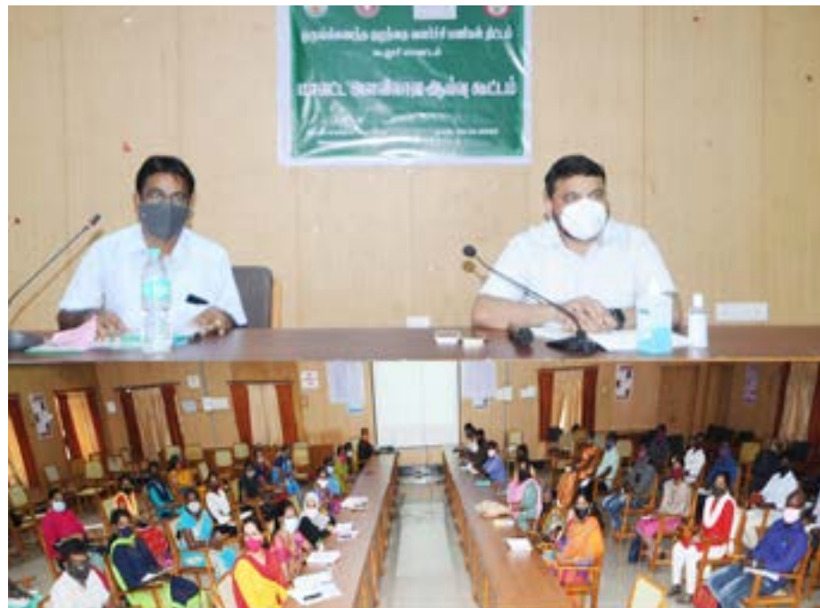
Cuddalore District Collector Chandrasekar Sahamuri recently organised a video-conferencing for all the employees of the Integrated Child Development Plan department. The Collector at the meeting instructed the officials to develop the nutritious food items being supplied to children, pregnant women and lactating mothers.

With the Health Department has been organising the free medical camps in 75 villages every day and collecting samples for tests from a minimum 1500 persons. The people in the district are quite relieved over the decreasing number of COVID cases and thanked the government for its efficient management in combating the Coronavirus and giving appropriate treatment to the patients for their speedy recovery.