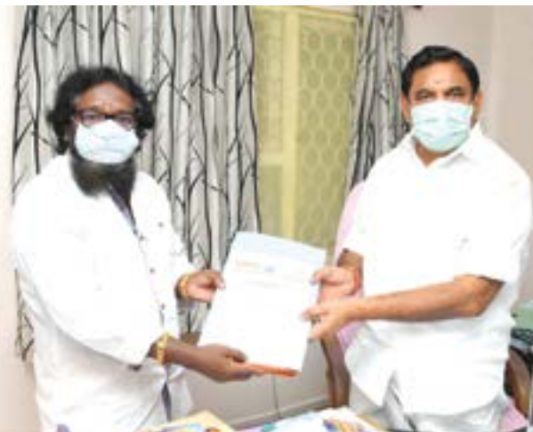
Thiruvadanai MLA Karunas called on Chief Minister Edappadi Palaniswami and handed over the invitation for the 113th birth anniversary Pasumpon Muthuramalinga Thevar on October 30.