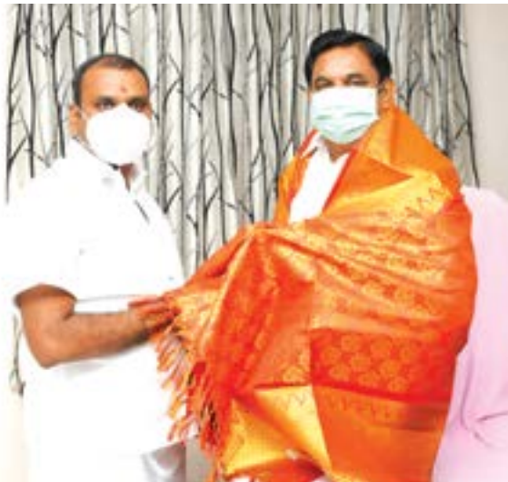
BJP State President L. Murugan called on Chief Minister Edappadi Palaniswami and congratulated him for announcement of AIADMK Chief Ministerial candidate for the assembly polls 2021.

While Murugan asserted that the AIADMK-led NDA alliance would form government in