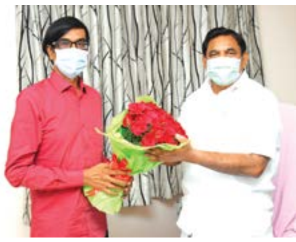
Actor Manobala called on Chief Minister Edappadi Palaniswami and congratulated him for announcement of AIADMK Chief Ministerial candidate for the assembly polls 2021.